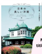
Beautiful Western-Style Buildings in Japan Takayuki Ito, X-Knowledge 2023