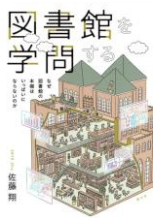
Studying Libraries Sho Sato, Seikyusha, 2024

Library supporters at HULS have selected books from a student perspective—essential texts for study and recommended reads for your post-secondary education. This year, many titles are on display on the 2nd floor of the West Library.