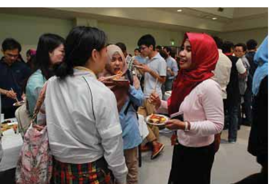
"Cross-cultural Exchange Event" with International Students