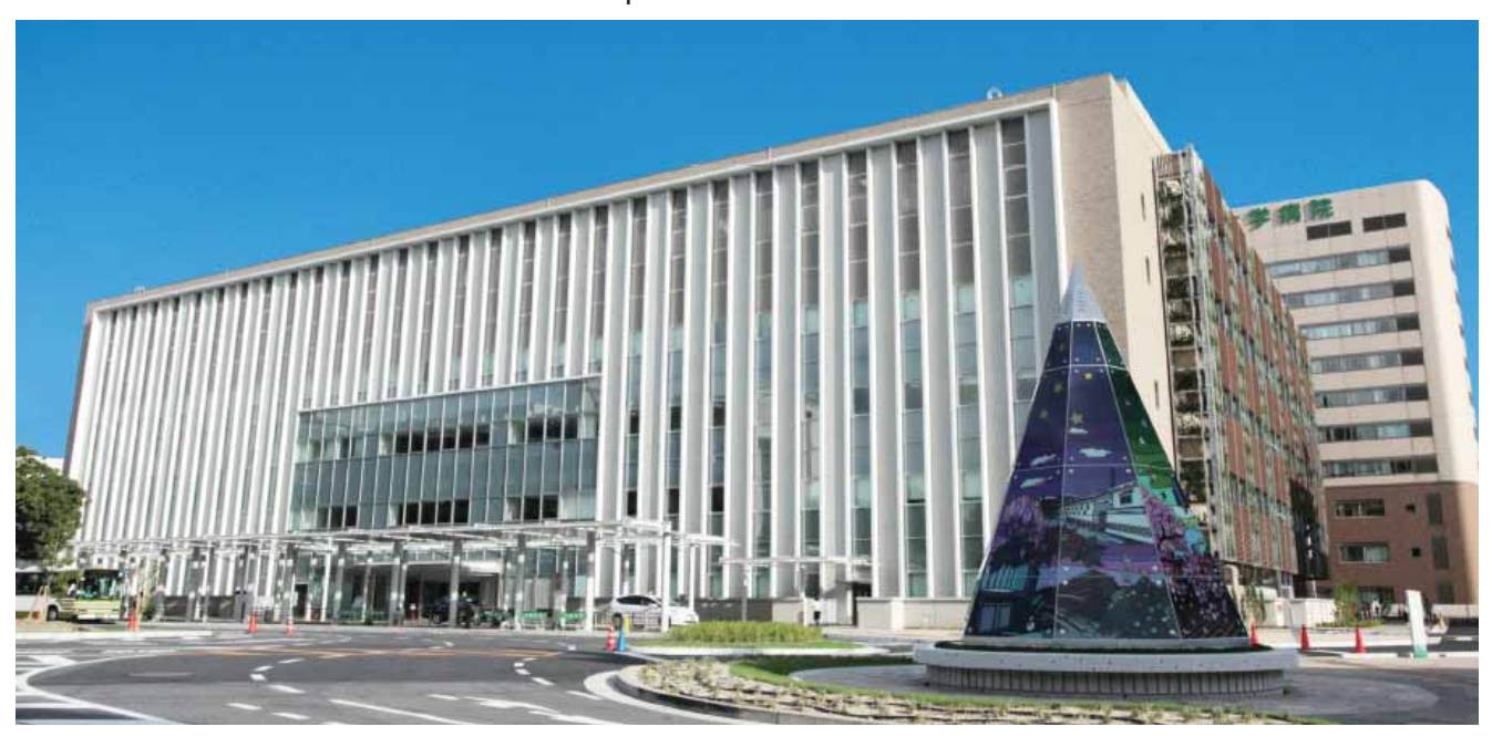
Hiroshima University Hospital

The construction of a new medical service building was completed in fiscal 2013. Upon the move to the new building, the outpatient and medical service sections of the medical and dentistry departments were concentrated, surgery rooms were added (from 13 to 17), the chemotherapy rooms were expanded (from 14 to 28 beds), new surgical intensified care units (SICUs) designed exclusively for post-operation were added (six beds) and other actions were made to reinforce the functions of the medical service. Moreover, the new medical service building also houses the "Futuristic Medical Care Center," engaged in cell therapy, regenerative medicine and other advanced medical care; and the "Sports Medical Center," which serves the particular needs of the area as the home town of a professional baseball team and a professional soccer team. By developing translational medicine and practicing advanced medicine, the Hospital has been developing a system to reflect research results into its medical practice.