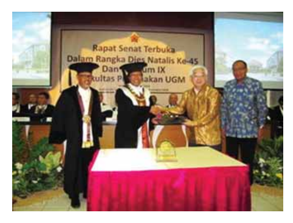
The Graduate School of Biosphere Science (HiroshimaUniversity) has concluded international exchange agreements with Faculty of Agriculture (Gadjah Mada University)

The Graduate School of Biosphere Science, the School of Applied Biological Science established the Research Center for Animal Science in fiscal 2013 and the Research Center for Japanese Foods in fiscal 2014, as incubation research centers of Hiroshima University. By conducting international symposiums and seminars, these centers have promoted collaborative research activities with overseas institutes. The number of granted patents increased from 17 during the First Medium-Term Period (fiscal 2004 to 2009) to 109 during the Second Medium-Term Period (fiscal 2010 to 2015).