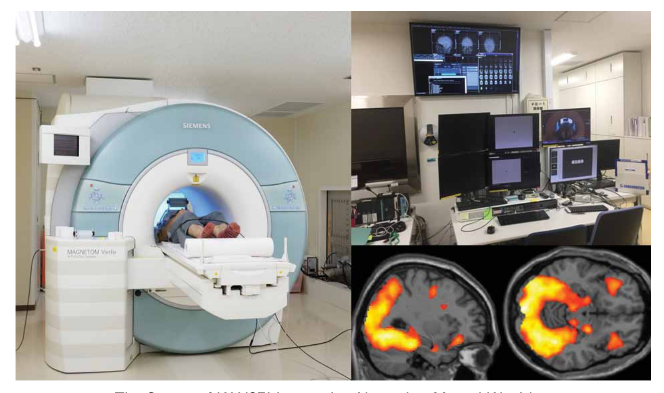
The Center of KANSEI Innovation Nurturing Mental Wealth

In fiscal 2013, MEXT selected the Center of KANSEI Innovation Nurturing Mental Wealth as a program of the Center of Innovation Stream. The University established the KANSEI COI Base as a management organization to promote this program. It has conducted research and development activities in collaboration with local private companies serving as lead players, the National Institute for Physiological Sciences, which serves as a satellite institute, and Shizuoka University (industry-academic-government collaboration). By fiscal 2015, the first phase of this collaboration had worked to establish a basic technology to visualize or remotely reproduce mental and sensory perception.