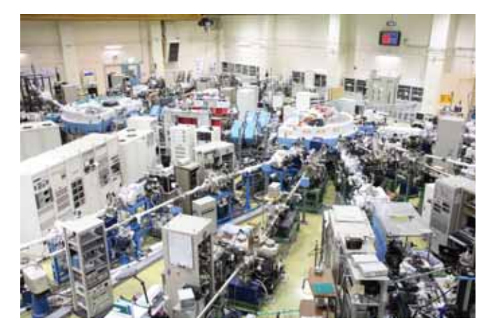
Hiroshima Synchrotron Radiation Center

At the Hiroshima Synchrotron Radiation Center, the newest quasi-periodic variably polarizing undulator, generating extremely strong radiation light, was installed for "research of the fine electronic structure" in Physicality II, which resulted in the discovery of a new topological insulator, a new superconductive state via orbital fluctuation, and a rule that exists between the strength of electron pairs bearing superconductivity and the superconductivity transition temperature. In the "research of physical properties of quantum spin" project, activities to pursue pioneering achievements have been conducted, including research for the creation of a high-efficiency spin-and-angle-resolved photoemission spectrometer.