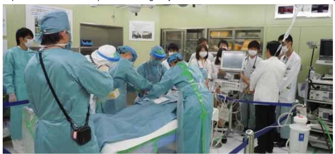
Provision of a clinical training environment for graduates

A questionnaire-based survey was conducted among residents. Based on the results of the survey, changes in trends in career path desire were analyzed, and training programs were revised and working conditions for residents were improved accordingly. A clinical training environment for graduates has been provided, including training seminars designed for residents in the first and second years, which are held about twice a month. As a regional tertiary medical center for radiation exposure, the Hospital has had doctors, nurses, clinical radiation technologists and other medical service providers participate in overseas training programs and special seminars in order to produce medical practitioners who can provide emergency medical care and service for radiation exposure.