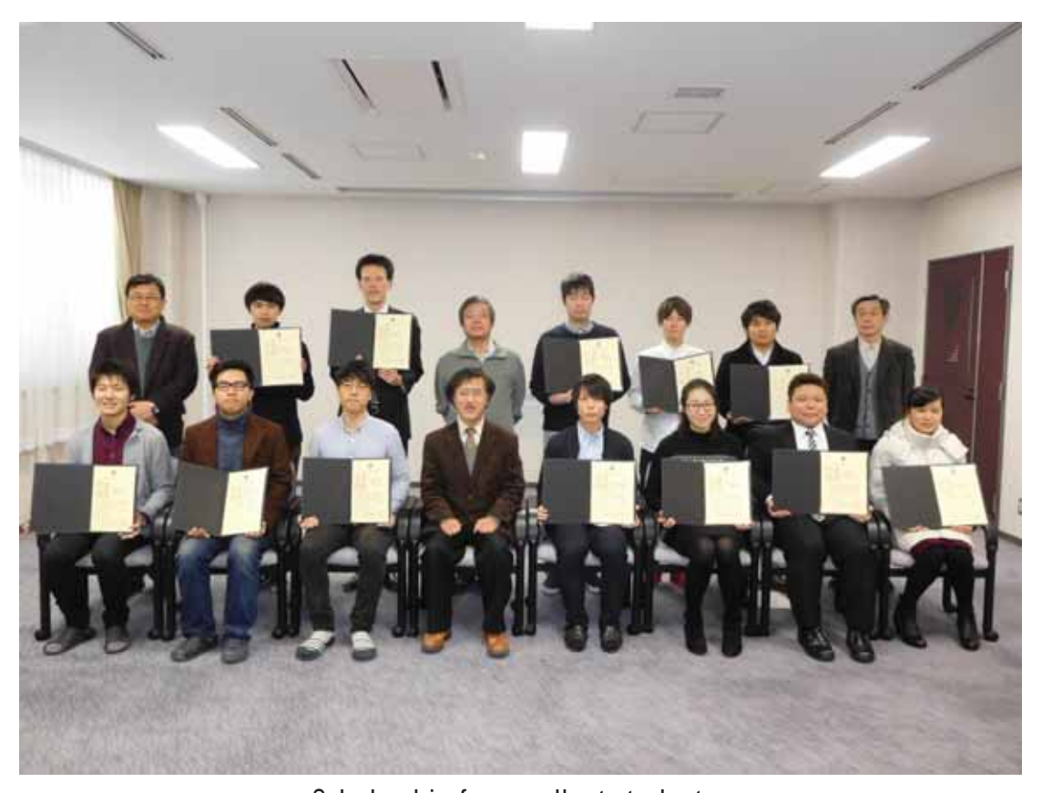
Scholarship for excellent students

By fiscal 2015, under the Hiroshima University Excellent Student Scholarship Program, a total of 682 qualified graduate school students and 39 undergraduate students with outstanding academic performance or activities have been commended, and they were exempted tuition fees for the second semester of the commended year. In fiscal 2014, the Campus Work Study Program was started. In this program, some undergraduate students who are exempted from tuition fees are employed as campus staff by the University. By the end of fiscal 2015, a total of about 11,600,000 yen in compensation was received by 104 student workers.