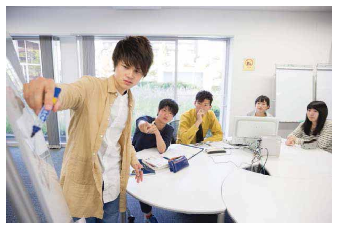
Hiroshima University Program of Specified Education and Study (HiPROSPECTS (R))

(Hiroshima University Program of Specified Education and Study), a program to evaluate the academic attainment level of students with respect to the knowledge and competence they should acquire to receive a diploma. To maintain and improve the quality of education, information exchange and discussion meetings have been held between the persons in charge of major academic subjects to find and address problems in this program. Based on these discussions, improvements have been made to the program. For students admitted in and after fiscal 2015, their attainment statuses in all academic subjects requiring credits to receive a diploma, including liberal art subjects, are evaluated.