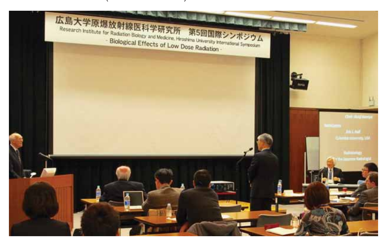
Research Institute for Radiation Biology and Medicine , Hiroshima University International Symposium -Biological Effects of Low Does Radiation-

The Research Institute for Radiation Biology and Medicine promoted collaboration with other institutes in establishing international education and research centers for radiation disaster medicine. Two facilities of this research institute, which were designated as centers for joint usage and joint research activities, were evaluated as "A" at the end of the period. These activities have also led to the designation of the "Research Base for Radiation Accidents and Medical Science," a network of joint usage and research centers with Nagasaki University and Fukushima Medical University for the Third Medium-Term Period (fiscal 2016 to 2021).