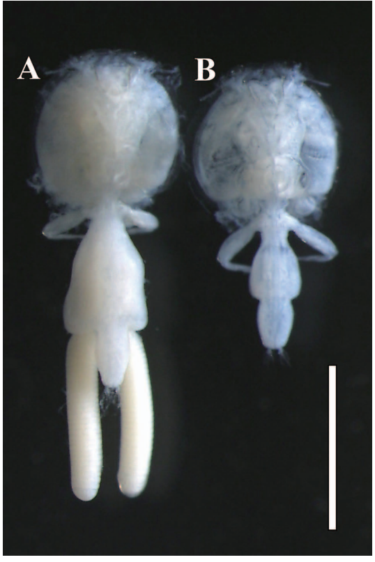
Fig. 1. Female (A) and male (B) specimens of Caligus spinosus Yamaguti, 1939 from the gills of yellowtail amberjack (Seriola lalandi) cultured off Tsuiura in Kamiura, Saiki, Oita Prefecture. Alcohol-preserved specimens. Dorsal view. Scale bar: 2 mm.

Twenty-four (18 adult female and 6 adult male) specimens of Caligus spinosus Yamaguti, 1939 (Fig. 1) were found on the gills of a single S. lalandi cultured off Tsuiura in Kamiura, Saiki. The morphology of the specimens agrees to the description of the species given by Yamaguti (1939), Yamaguti and Yamasu (1960) and Choe and Kim (2010). Shiino (1960) reported " Caligus spinosus " from S. lalandi (recorded as Seriola aureovittata Temminck and Schlegel) and an unidentified fish from Japan, but his caligid specimens are currently regarded by Choe and Kim (2010) as Caligus aesopus Wilson, 1921. While C. spinosus is known to infect both S. quinqueradiata and S. lalandi in Korean waters (Choe and Kim, 2010), it was reported only from S. quinqueradiata in Japan (Yamaguti, 1939; Yamaguti and Yamasu, 1960; Fujita et al. , 1968; Izawa, 1969; Ho et al. , 2001; Nagasawa et al. , 2010; Cruz-Lacierda et al. , 2011). Fukuda (1999: 56) stated C. spinosus parasitized S. lalandei farmed in Oita Prefecture, but he did not provide any morphological characters of the caligids collected. The present collection of C. spinosus represents the first confirmed record of this parasite from S. lalandi in Japan.