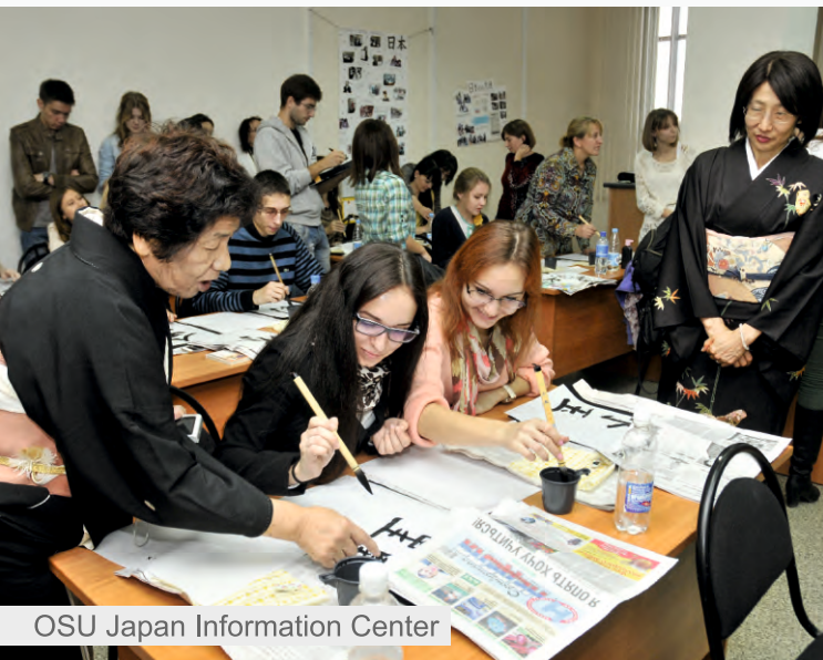
OSU Japan Information Center