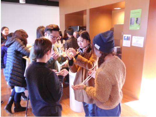
Teaching a traditional Japanese game