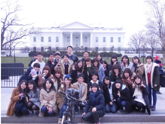
In front of the White House