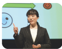
HIRAKU 3MT 2019 Competition Winner

The doctorate students will effectively showcase their research within a limited time span of three minutes in a language appropriate to a non-specialist audience. Please feel free to cast your vote to the researcher that inspires you the most. Pre-registration is required for audience members who wish to have the chance to vote. The Competition will also be live-streamed via YouTube for those who prefer to simply watch the event. You can find more details about the Finalists, pre-registration, and the live-stream on our official website.