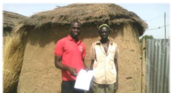
Fieldwork in the West Manpuji district.