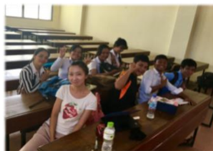
With students of the Japanese Business Language Course at the Cambodian Mekong University.

G.ecbo program is a valuable and meaningful program in Hiroshima University that provides students with overseas internship opportunities. I do believe what I have learned and gained from G.ecbo program will be beneficial to my further development.