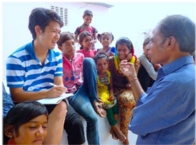
Conducting an interview survey about the management of NGOs.