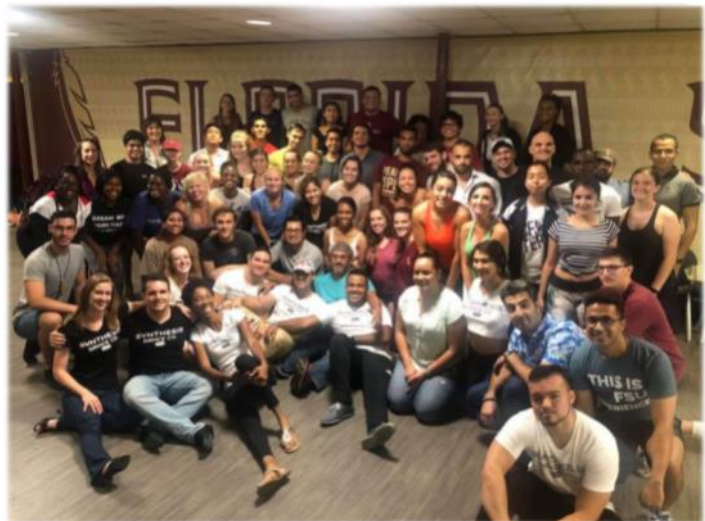
At Florida State University