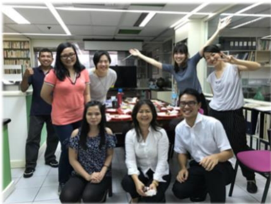
Taken after finishing the last presentation at the office in the Philippines.