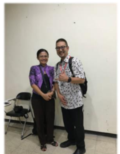
During my internship at Brawijaya