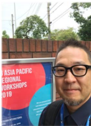
Regional international education training workshop