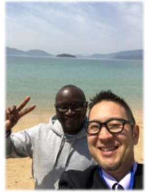
Fellow IDEC Graduate Student from Rwanda who cooperated with my school on an international exchange discussion and exchange

After graduating from IDEC, I was fortunate enough to be selected as a foreign language instructor at a unique and innovative public JHS/SHS that has adopted the international curriculum of a world-renowned organization that specializes in international project-based learning and education. This is a first-of-its-kind institution in all of Japan and it is exciting to be working here. It involves a lot of patience, creativity, experimentation and perseverance.