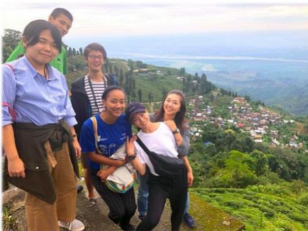
With participants of a study tour at the internship location.

I'd like to become the kind of teacher who can create classes where I think together with the children. I'd like to be the kind of teacher who helps the individuality of each child develop. Therefore, I need to be gathering information about various things and always be ready to take on new challenges.