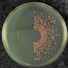
Colony formation compared the effects of irradiation with and without UV light on the growth medium of MRSA (methicillin-resistant Staphylococcus aureus ); the right side was not irradiated.

A reas around hospital beds and hospital door handles are sometimes covered with pathogenic microorganisms. Invisible and transmissible via tools and human hands to other patients, they can cause nosocomial infections.