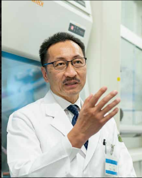
Professor School of Medicine Department of Infectious Diseases, Hiroshima University Hospital