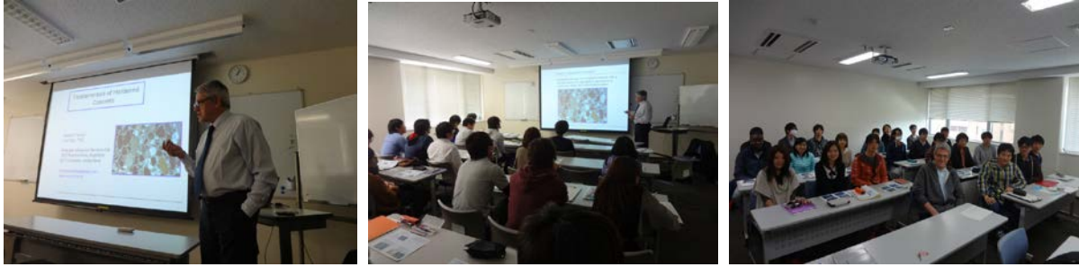
Lecture on “Advanced Structural Concrete”