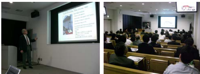
Seminar in Tokyo