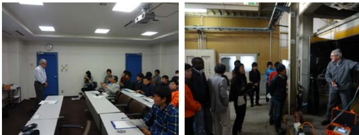
Seminar with members of Structural Materials and Concrete Structure Laboratory and demonstration