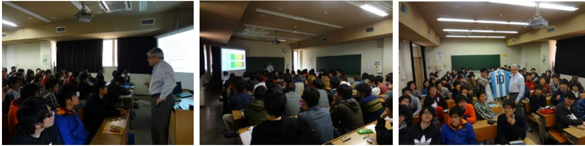
Joint lecture on “Advanced Structural Concrete” and “Reinforced Concrete Structures”