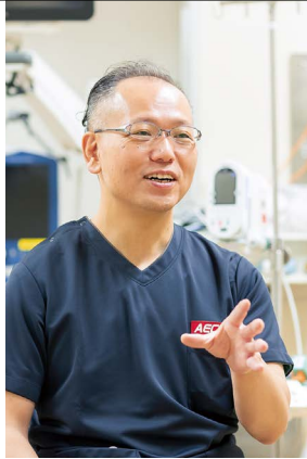
Associate Professor, School of Medicine Graduate School of Biomedical and Health Sciences