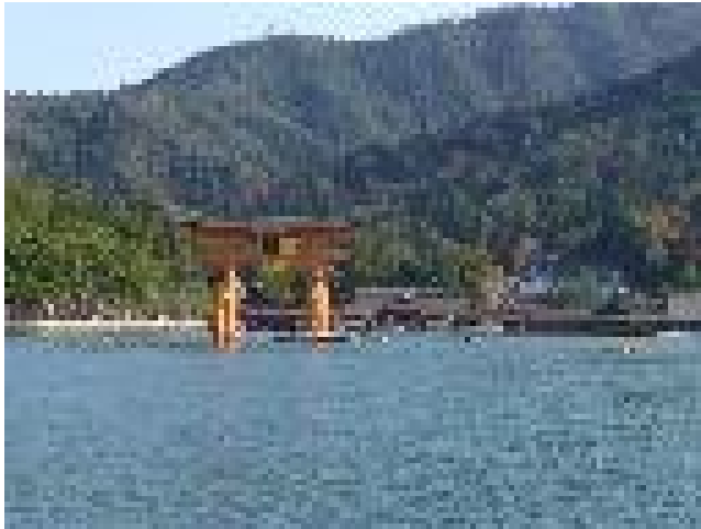
Culture and Tourism