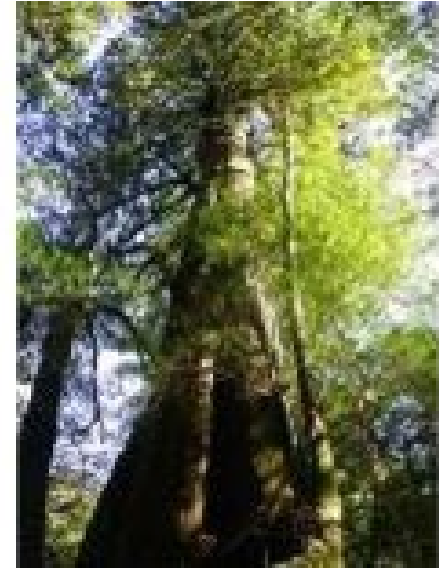
Environment and Society