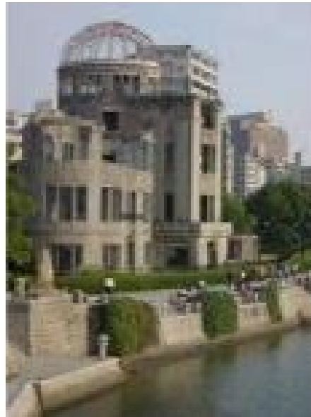
Peace and Communication