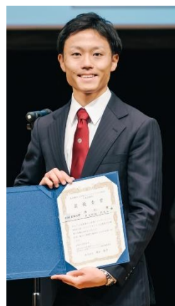
Winner (Japanese Division)