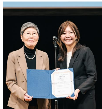
Head of Jury Winner (English Division)