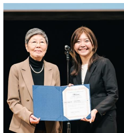
Head of Jury Winner (English Division)