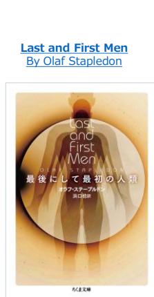
Last and First Men By Olaf Stapledon