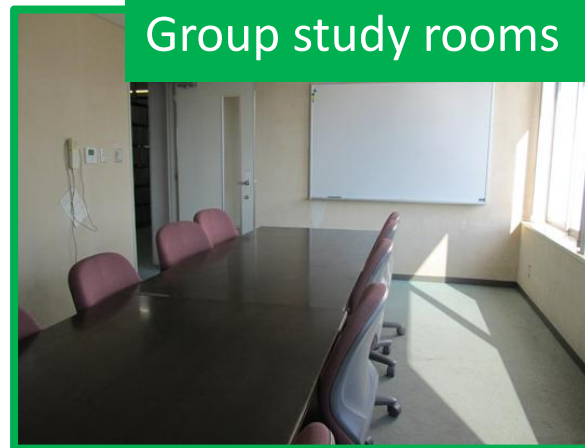
Group study rooms