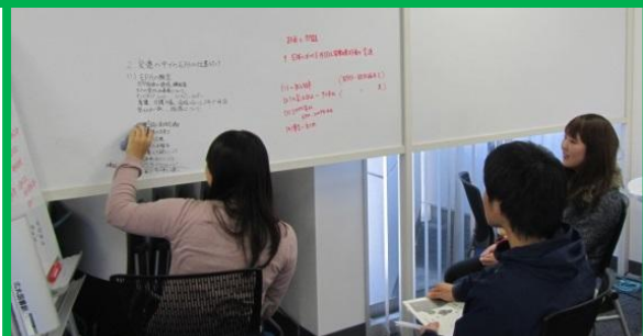
BIBLA: Group learning spaces