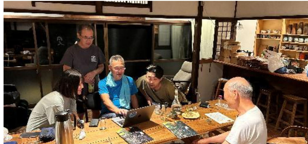
Mamena & mirumirai