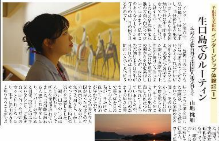
Hirayama Ikuo Museum of Art