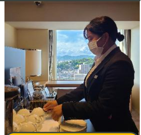
Grand Prince Hotel