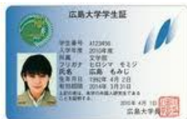
Student ID card

You need your student ID card to borrow materials