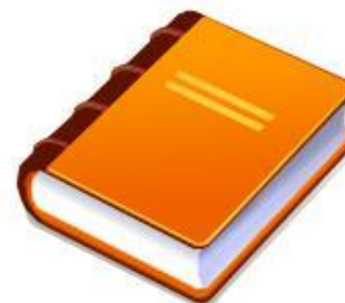
Material you want to borrow

Note: To access books and other materials at the East Library, apply through the library website.