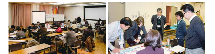
At the meeting venue