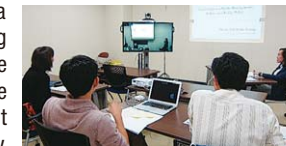
People at the Kasumi campus also participated in the seminar through the videoconference system.