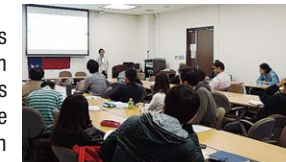
One scene from the seminar at the Higashi-Hiroshima campus

This seminar was televised to both Higashihiroshima and Kasumi campus. Forty people including eight Phoenix program students, fourteen TAOYAKA program students, eight other students and ten teaching staff attended. Those who attended stated that it was a very informative and useful discussion and suggested they would like to participate in a future summer program if the opportunity presented itself.