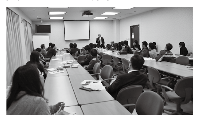
LBJ-UT/A の研究科長を招いてのセミナー The seminar at IDEC with the Dean of LBJ-UT/A

The SEP offers two practical lectures on development project management and career development as well as specially coordinated internship and filed work in addition to the IDP that are of direct benefit to applying careers in international organizations. The course can be tailored and managed jointly by student, supervisors and professional mentors with use of E-Learning Portfolio. The additional benefits and educational services to students in the SEP program will be continuously prepared.