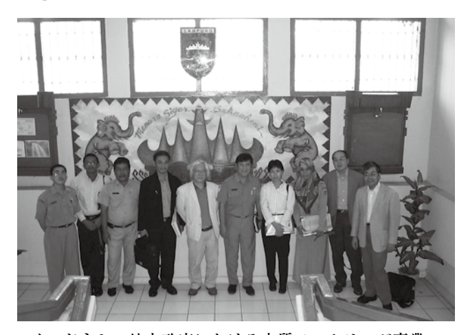
インドネシア地方政府における水質モニタリング事業の 現況調査(2007年、南スマトラのランプーン) Survey on the Project of Water Quality Monitoring with the Indonesian Local Government (South Sumatra in 2007)

Finally, I would like to say thank you very much for your cooperation and assistance.