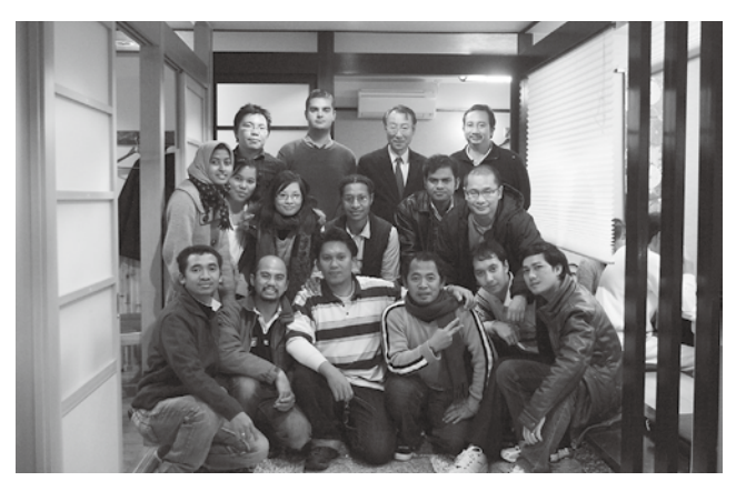
ゼミ生たちと、新年会にて New Year Party with Students

I would like to thank my colleagues in development policy course, who always guided me in friendly atmosphere. I would also like to thank colleagues from other courses in different disciplines. From them I learned many different "academic cultures", which widened my view. I also like to thank people in administration office. Their assistance and support were always positive and professional. My last but not least thanks go to the fellow students. For me teaching