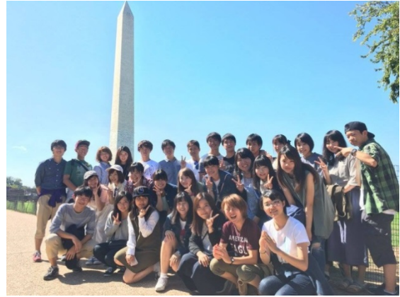
Exploring Washington D.C. on the last day of the program