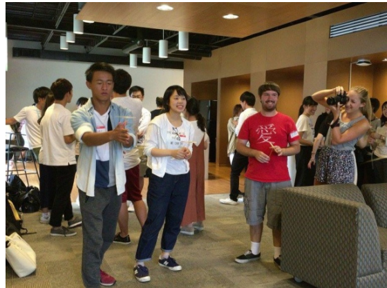
Introducing Japanese culture