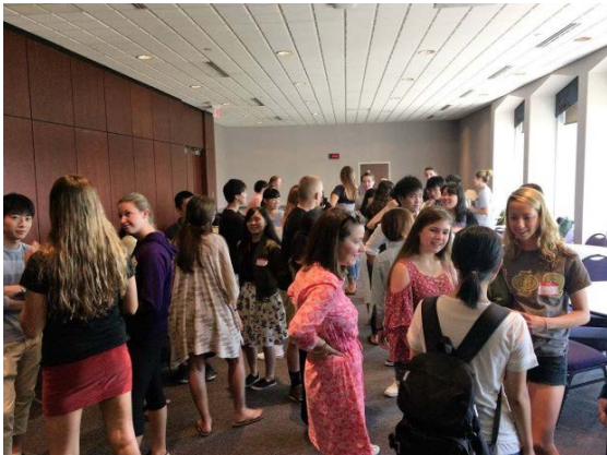
Exchange activities with local students in class