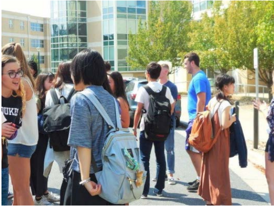
Host RAs came to meet the participants on the day they arrived by bus.

they gained through the START Program, at the follow-up session after returning to Japan the participants shared their strong desires to further their study in languages, study abroad, and take part in international exchange activities inside the campus.