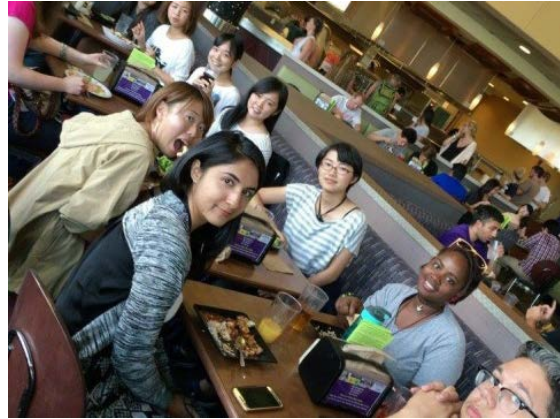
Having a meal with local students at the cafeteria