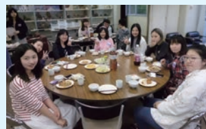
国際交流会館ウエルカムパーティ Welcome party at the International House