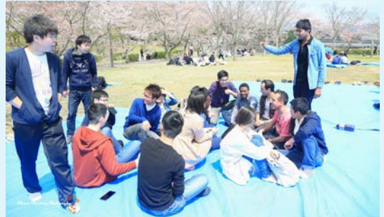
4月のお花見会には、多くの留学生・日本人学生が参加しました。 Many International and Japanese students joined the cherry-blossom viewing party in April.