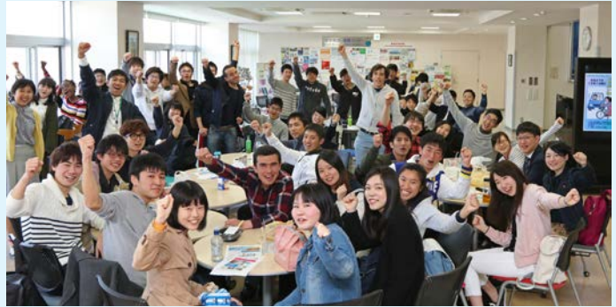
学生プラザの中では、国際交流イベントが多数開催されています。 Various kinds of International events are held at the Student Plaza.