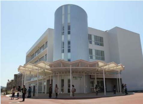
学生プラザ Student Plaza