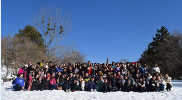
留学生・日本人学生が、雪体験を通じて交流を深めました。 International and Japanese students deepen friendships through playing in the snow.