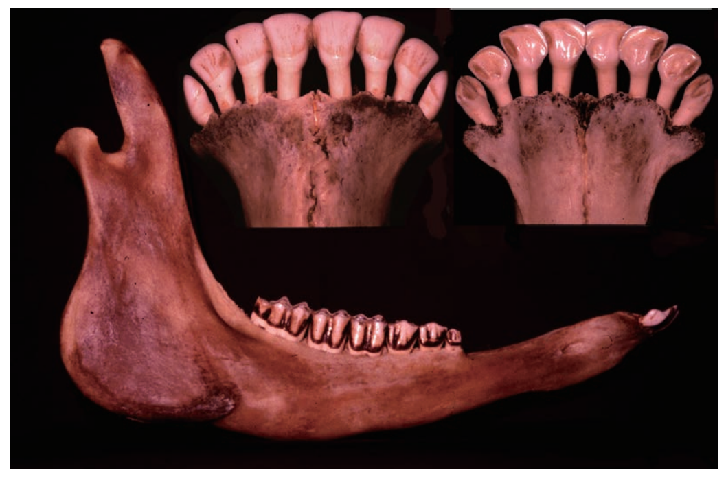
Fig. 3. Mandible bone of Cow 28 (1st calving)