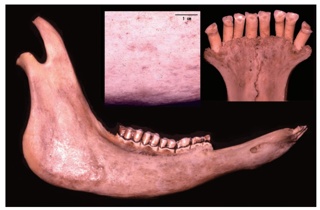
Fig. 4. Mandible bone of Cow 1, suffering from Milk fever (11 calvings)