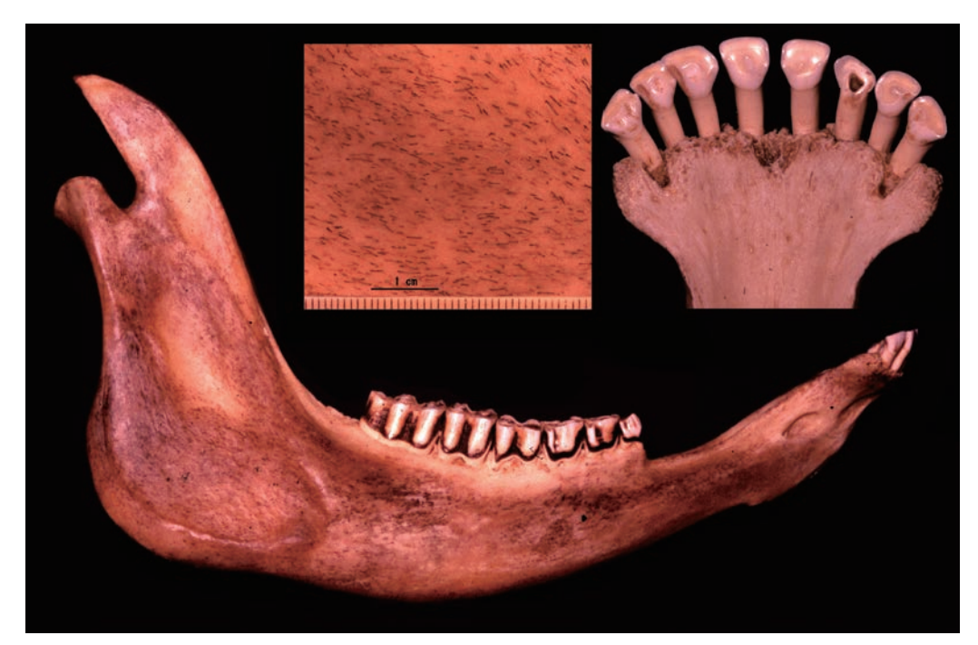
Fig. 2. Mandible bone of Cow 7 (8 calvings)