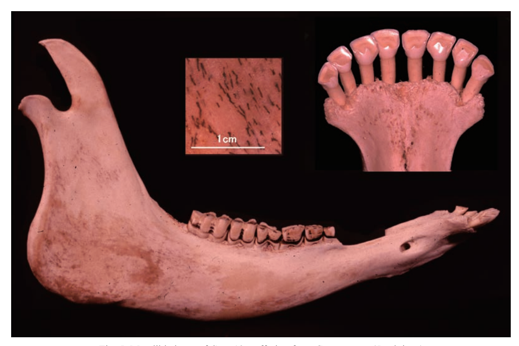
Fig. 5. Mandible bone of Cow 12, suffering from Grass tetany (5 calvings)