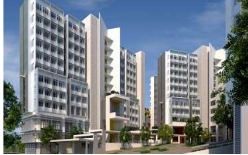
One of NTU's Hall of Residence