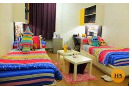
Example of twin sharing room